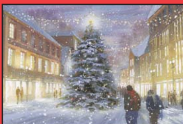
Winter in the Town

Please make cheques payable to "Spinal Injuries Scotland".