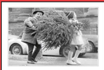
Taking Home the Tree

* If you choose to make a voluntary donation please remember to tick the "Gift Aid" box which allows SIS to claim 28p back for every £1.00 you donate, at no cost to you.